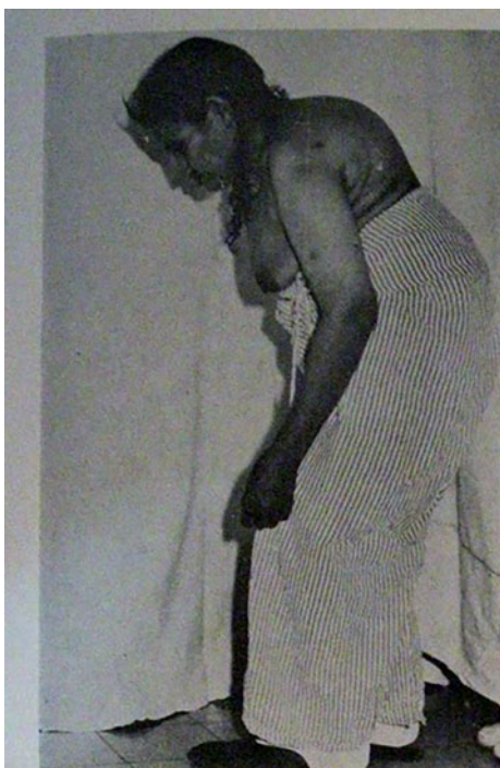
Fig 10.—Typical severe kyphosis in an elderly woman as a result of osteomalacia (in this case probably combined with osteoporosis).

ture which set in motion processes of biological destruction and repair of a nature similar to that in callus formation. The first stages of the process develop normally, but at the stage where the newly deposited osteoid should be calcified, the process is blocked.