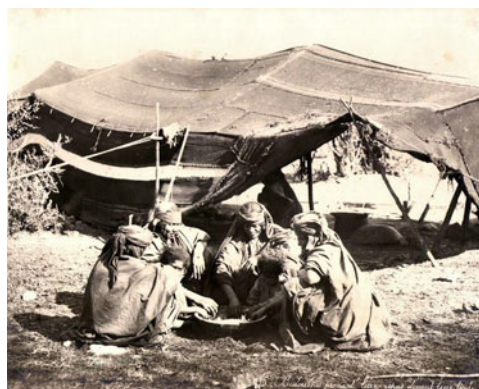
Figure 4. Bedouin women partaking a meal (Bonfils 1867).

The last photograph from the nineteenth century, Figure 4, shows women sitting close together in a circle. They are seated on the ground, not paying attention to the photographer. Photographic equipment in 1893 was cumbersome, thus the lack of spontaneity in the photograph. The women are dressed in similar clothes and are the same height; they cannot be distinguished from each other. Bedouin women were subjugated to two cultural codes that govern Bedouin life: the sexual code and the collective code (Abu Rabia-Queder 2007, 72). The photograph does not allow the viewer to connect with the women in the image. It is taken at an angle from above, so that the women occupy the bottom part of the frame, while the tent visually hovers over them, relatively