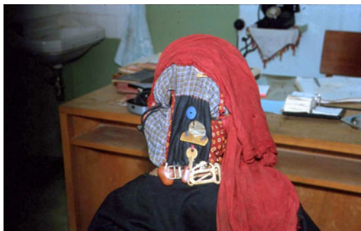
Figure 5. Photograph of hand-sewn head shawl.

the back, the conglomeration of items sewn into the shawl, and the striking red cloth on the right side of the woman's head all turn this into an odd photograph. In the background we can discern Ben Assa's desk, telephone, sink, a desk calendar, and other objects. The photograph juxtaposes Bedouin ethnic culture with modernity, which appears in the form of a dark desk, crossing the frame diagonally. The woman's ethnic culture is positioned vertically in the center of the frame, controlling the composition while remaining disconnected from the background.