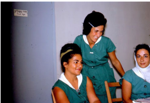
Figure 12. Medical staff.

Figure 12 on the right fill the frame; their eyes sparkle, and they appear happy and content. Each one is positioned in a different body posture; there is little space between the photographer and the nurses. They are aware that they are being photographed and seem at ease, in comparison to the Bedouin woman in Figure 11. These photographs present how people from different cultures respond to being photographed. Their demeanor, body postures, smiles, and gaze all affect the way in which they are perceived by the viewer. This is an example of how the viewers see the Bedouin women through Ben Assa's eyes, based on his relationships with his patients.