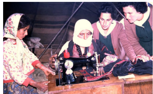
Figure 10. Bedouin woman sewing.

Figure 10 shows the medical staff observing a woman using a sewing machine. They appear to be immersed in her work, observing and assisting her at the same time. It is unclear whether the sewing machine was part of her everyday culture and they were learning how to sew from her, or the other way round. The woman and the machine are at the center of the image and the focus of attention. The garment being sewn is a traditional Bedouin garment. This photograph indicates the involvement of the medical staff and their interest in the Bedouin