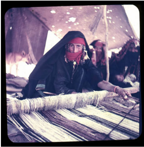
Figure 14. Bedouin woman weaving a carpet in a tent.

has no say in her own marriage (El Aref 1933, 123–126). Ben Assa did not attempt to change their culture, being familiar and sensitive to the Bedouin traditions and superstitions regarding women.