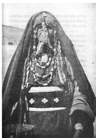
مره بنت علي بن مصيلك « من عرب الجراوين » وقد جئتني تكو امرها لأن أحد أبناء طيبتها ياتونها ياتونها ولا يكفوا زانية . وقد وصحت القصة فلهذا سمكتها ليعلموا على منصبي بأن ينفذوا جليبا من أنكال كسوفهم لمرحبا المظنوم وأن يشار عما فرط متعني ثلاثة يوت من يوت العرب المشهورين : فاضل الأمر بواجبهم ، ويغالبوا في الخيام .

El-Aref included in his first book ( El-Qada Bein el Badu [1933, 128]) a photo of a fully covered Bedouin woman from the el-Jarawin tribe (Figure 3). This led to an incident about which we learn from Professor