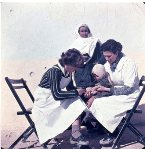
Figure 9. Nurses treating child.

examine girls in the presence of their mothers. When necessary, he would conduct breast exams.