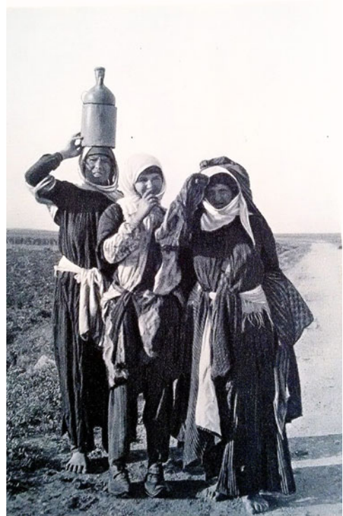
Figure 2. Bedouin women carrying water.

The women in Figure 2 appear to be looking back at the photographer, passively. Evidently, they stopped their walk along the road and posed for the photograph. They do not engage with the photographer, though they consent to being photographed. The woman in the center is covering her mouth and looks sideways, as if embarrassed; the other two women are observing the photographer while posing for the photograph. Their attire