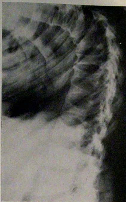
Fig 11.—Lateral roentgenogram of the spine.

Thus, just as in rickets where the phenomena are most pronounced in the areas of increased turnover of bone, viz, in the growing epiphyses, in osteomalacia the changes are most marked in areas where under the impact of mechanical strain and the ensuing repair, the turnover processes are also increased. Mechanical strain, which normally results via an increased turnover in fortification of the bone in the strain-bearing places, in osteomalacia is causing local decalcification and deposits of osteoid which are large enough to become visible as Looser zones on the x-ray picture. Where generalized replacement of bone by osteoid occurs and the mechanical strain continues, deformities of the chest, pelvis