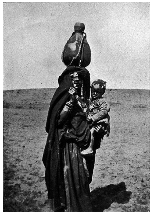
Figure 1. Bedouin woman carrying baby and water jar.  Created/published: approximately 1900 to 1920.

The Bedouin woman in Figure 1 covers her face. She is unidentifiable as a person to the photographer, but certainly belonged to the group of black ex-slaves among the Negev Bedouin. The slight tilt of her body signifies a compliance with the photographer. This photograph constitutes an encounter with two different cultures, that of the Bedouin woman and that of the male Western photographer, created for Western audiences and in accordance with their preferences. The physical distance between the photographer and the woman and the empty space in the background signify the social and cultural distance that existed between them.