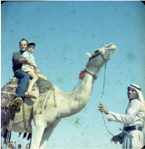
Figure 18. Child on camel.

in the health system, faithfully guarding their best interests, had a detrimental effect on the Bedouin ... The four clinics that were opened with much pomp and ceremony stand closed, gathering dust" (Shvartz et al. 2003, 63). Shvartz et al. write that "curative care was transferred to the Kupat Holim [public health care system] in 1972. All the other functions that Ben Assa had performed for the Bedouin were closed down. At that time, Kupat Holim , the primary health fund in the country, provided health services to 80 per cent of Israel's inhabitants" (ibid., 61). Ben Assa's position as full-time physician for the Bedouin population, assisted by a trained nurse and entire staff, was never refilled, which led to "widespread dissatisfaction of the Bedouin with the quality of free treatment provided by government-run curative services" (ibid., 65). Thus, his devotion, expertise, and actions at that point in time enabled him to create his unique collection, which could not have come into being under any other circumstances.